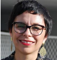
Pilar Moraga Sariego

Chief Judge of the Land and Environment Court of New South Wales, and Governing Committee of the Global Judicial Institute on the Environment